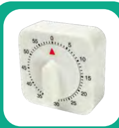
~ 1 min