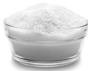
1/4 CUP sugar