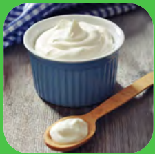
3 CUPS greek yogurt