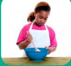
mix bowl #2